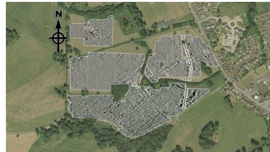
The geophysical survey, Dinefwr Park by Stratascan

This work is being funded by the Heritage Lottery Fund, Welsh European Funding Office and the National Trust.