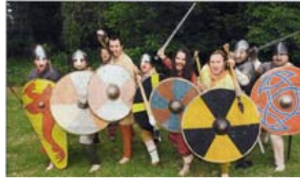
The Gweryn-y-Gwyr re-enactment group.