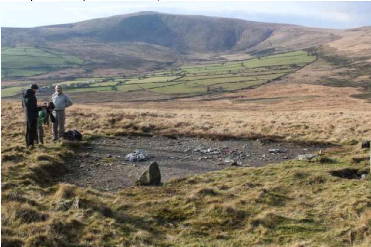
The crash site of Liberator EV881 where 6 crewmen died.

The Liberator belonged to GR (general reconnaissance) VI of 547 Squadron based at St Eval, Cornwall. The aircraft flew into Carn Bica, Preseli Hills at night on 19 September 1944. Six crewmen were killed, 3 survived. In 1984 (50th anniversary), a memorial was placed at the crash site by the Pembrokeshire Aviation Group which was visited by relatives on the 60th and 70th anniversaries. The crew were tasked with anti-submarine duties from St Eval and were deployed to rendezvous with a RN submarine to practice radar and Leigh Light skills. Instead of skirting Wales and using the Smalls lighthouse as the navigational fix, the crew cut across the tip of south-west Wales to make sure that they made the rendezvous. The Squadron Operational Record Book notes at 'approximately 22:50 hours on September 19th, during the hours of darkness, aircraft EV881, flew into the crest of a hill 4 miles northeast of Maenclochog, South Wales. The aircraft caught fire and W/O two of the crew were killed; another died in hospital and the remaining three were injured and detained in hospital. The cause of the accident is believed to be an error of navigation as the crew were briefed to proceed to an 'Oasthouse' exercise via the Smalls light'. The court of inquiry heard that the altimeter had been set wrongly and was reading too high. (F.Sage, 2013 based on Evans, 2005 and Doylerush 2008). Maritime Officer, RCAHMW 2011