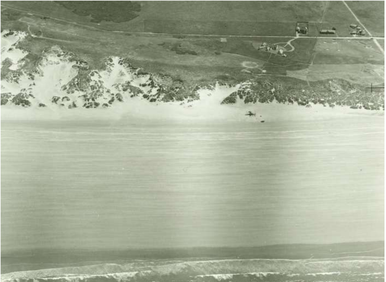
Aircraft crashed on Borth beach, shown on RAF aerial photograph 1940

Prepared by Dyfed Archaeological Trust For Cadw